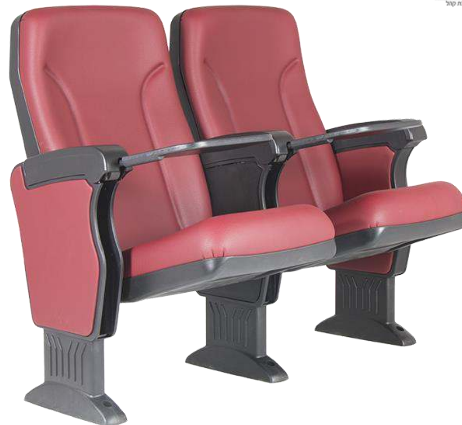
מושבים מתוצרת Euroseating דגם – Argentina כולל משטח כתיבה