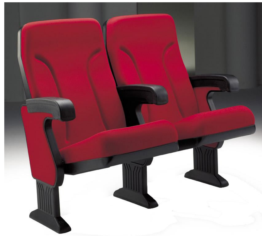
מושבים מתוצרת Euroseating דגם - Argentina