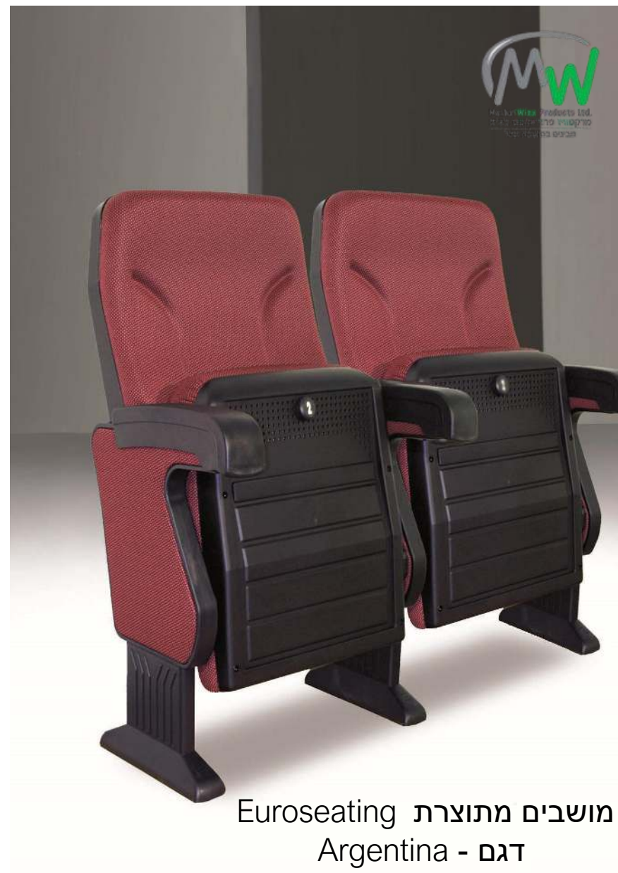
מושבים מתוצרת Euroseating דגם - Argentina